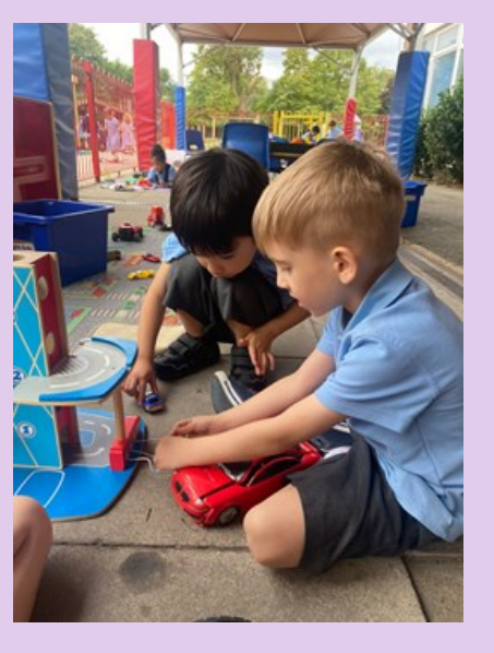
Our Reception children have enjoyed getting to know each other and learning to play together.